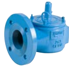
SERIES 1360A VACUUM RELIEF VALVE (Side Mount)