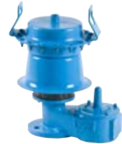
SERIES 1500 AIR OPERATED PRESSURE/VACUUM RELIEF VALVE