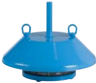
SERIES 2300A PRESSURE RELIEF VALVE