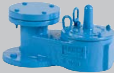
SERIES 1300A VACUUM RELIEF VALVE