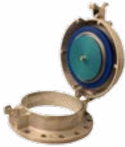
MODEL 12-TH THIEF HATCH