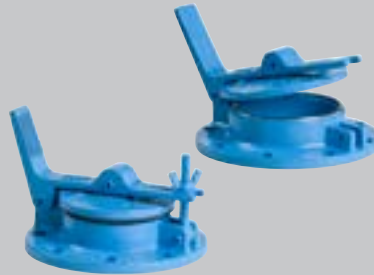
MODELS 6000/6100 GAUGE HATCH